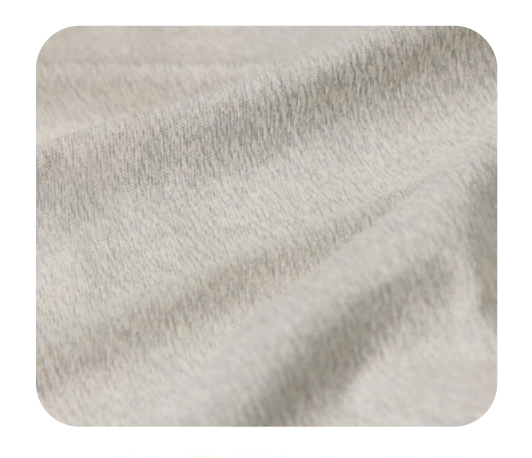
For Performance Fabric